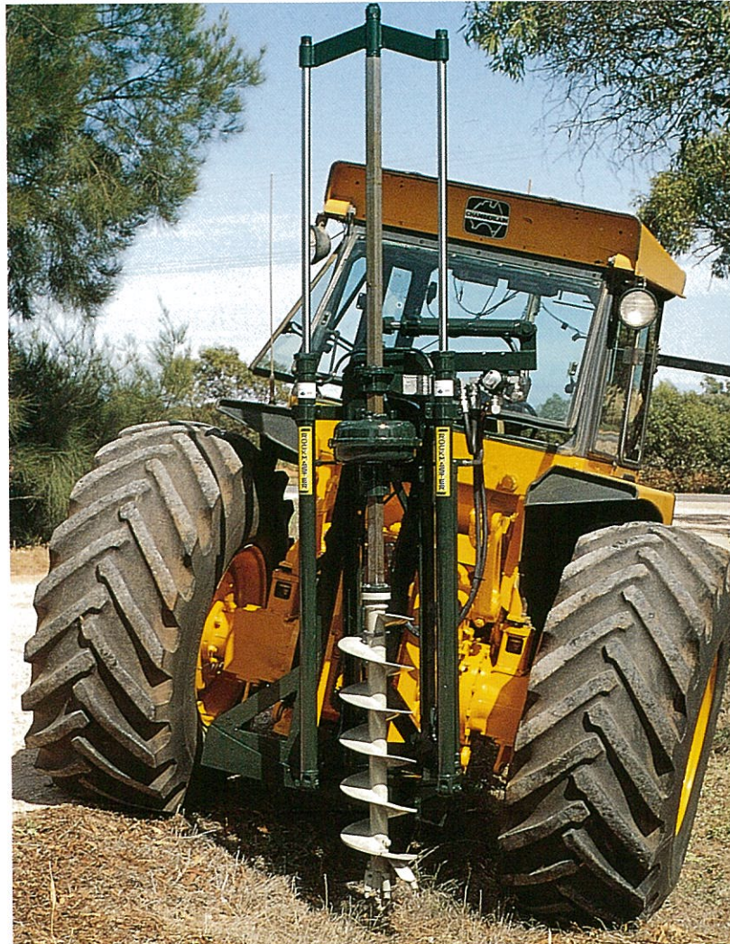
Hydraulic side tilt digger fitted with 11" rock auger.

Front Page Standard 3'0" digger fitted with 9½" rock auger.