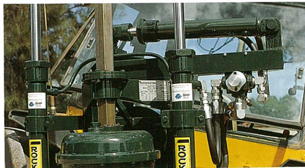
Hydraulic Safety Valve.