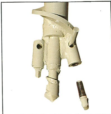
Quick removal of tungsten tips.